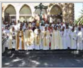
Page 5 Chrism Mass 2024 at St George's Cathedral