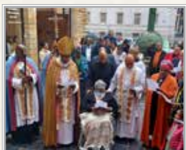
Page 4 The Dean of Cape Town retires