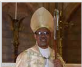
Page 3 From the Bishop's desk April 2024