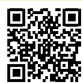
Scan QR code with your mobile and learn more about the Diocese of Cape Town