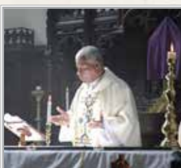
Page 6 April 2024 Ad Laos