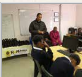
Page 7 School shoe donation to Hout Bay